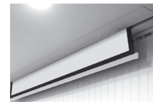
Ideal for ceiling or wall mounting